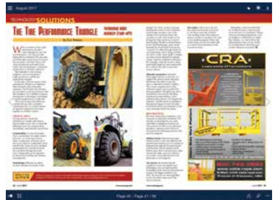
MCS Digital Edition

*For full page ads and two-page spreads, add a bleed of at least .125" (1/8 inch) on all sides